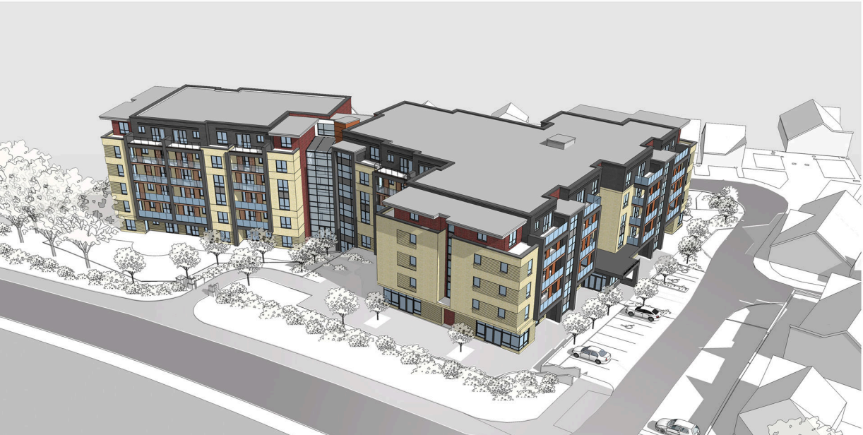
Phase 2 - Construct New Phase Two Including Link