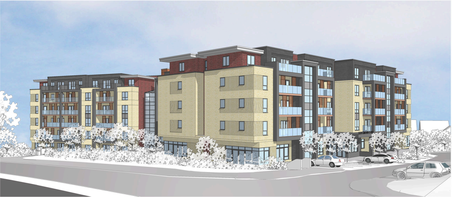
View From Severn Drive/ Minsterley Close Junction