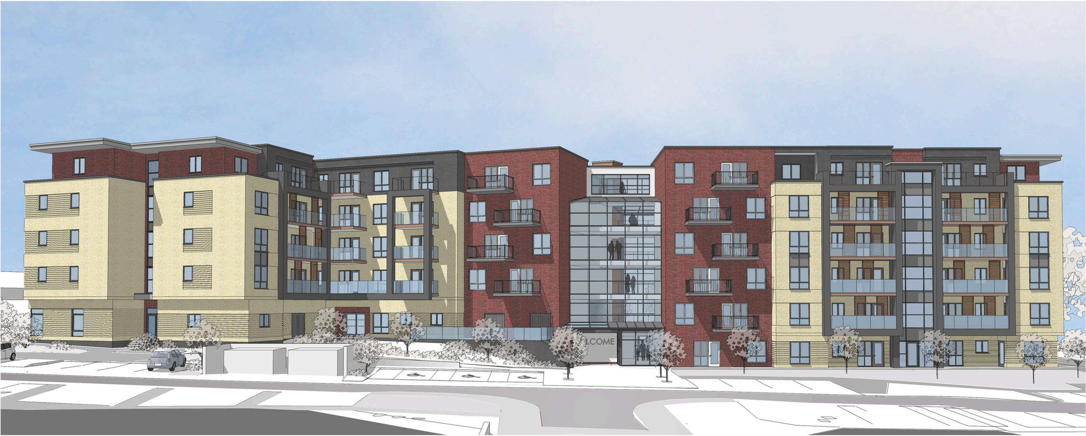
Internal Road Elevation - East Facing