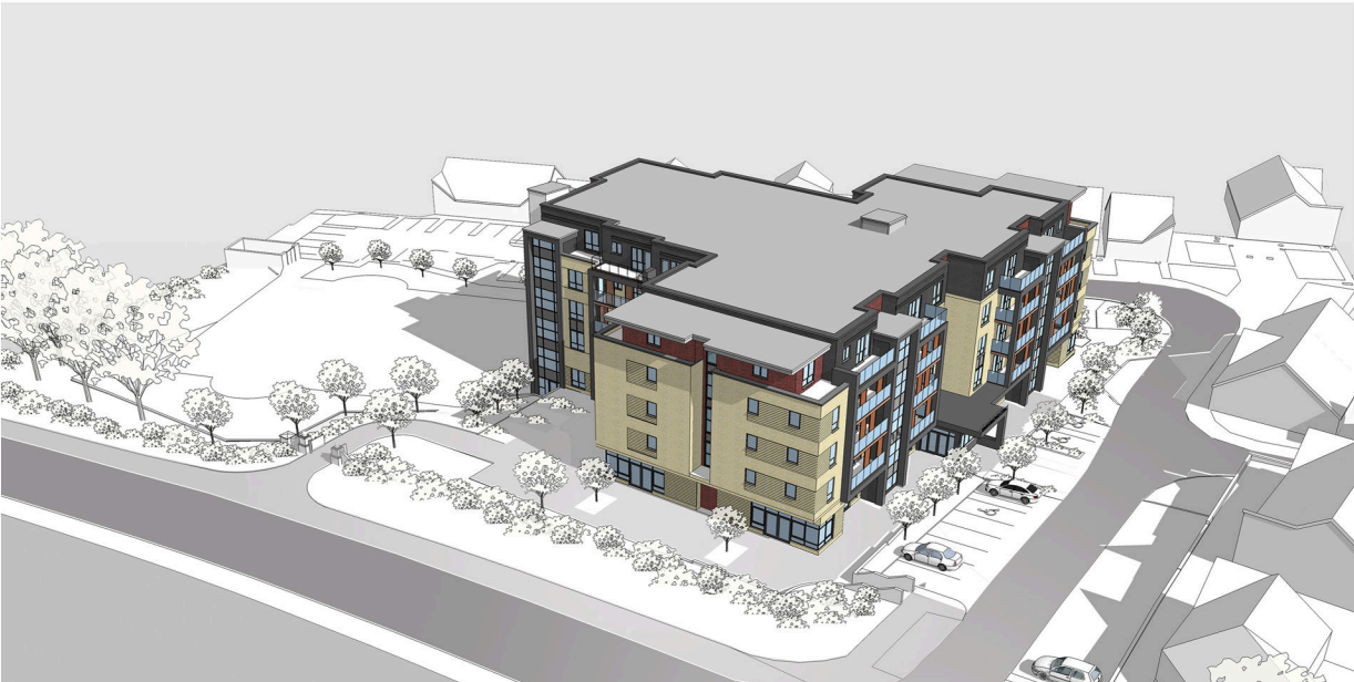
Phase 1b - Demolish Existing Apley Court