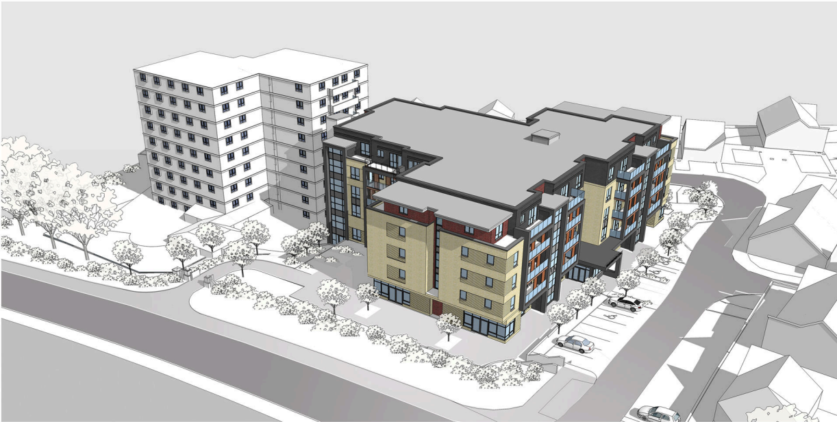
Phase 1a - Construct Phase One