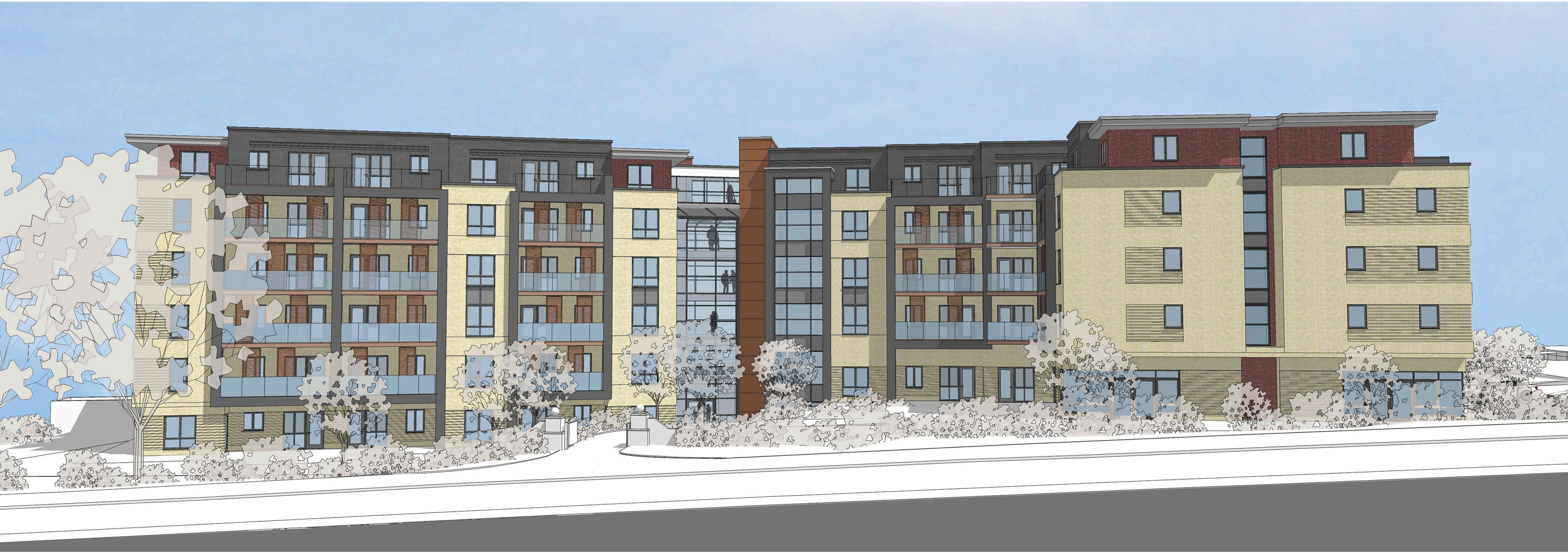
View From Severn Drive - West Facing Elevation

The copyright © of this drawing is vested in the Architect and must not be copied or reproduced without consent.